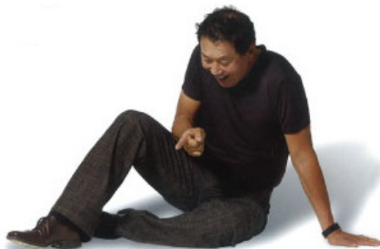
Mr Robert Kiyosaki, Best Selling Author Of 'Rich dad Poor Dad' say: 'Let's get them out of The Rat Race.'